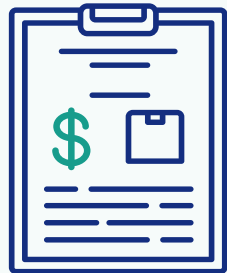
EMPLOYMENT & PAYROLL TAX